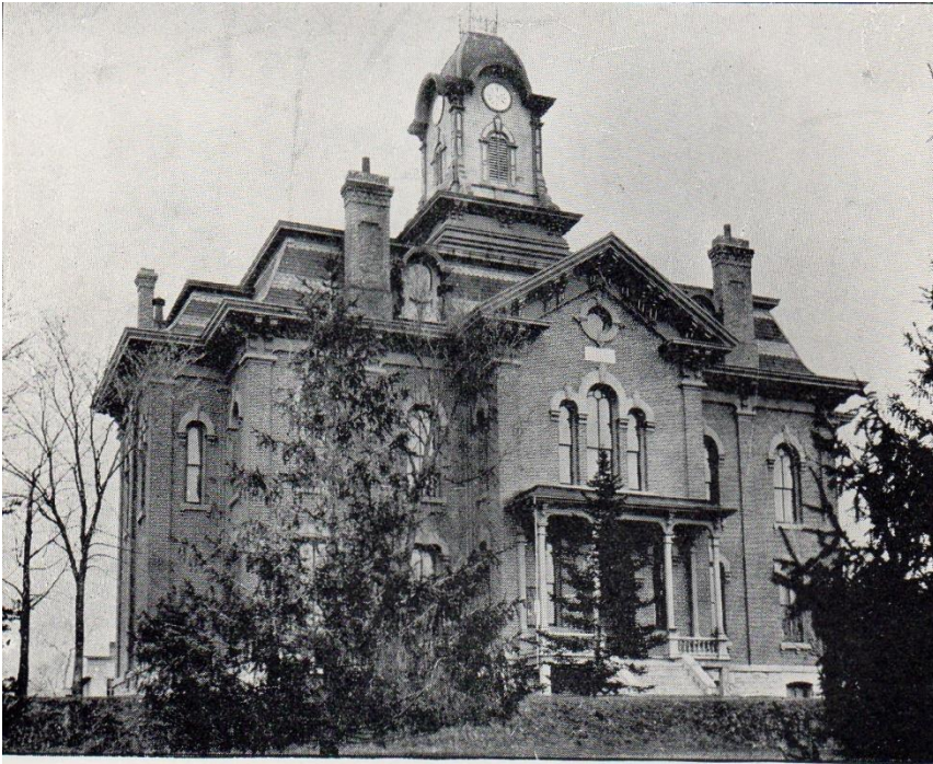
WRIGHT COUNTY COURT HOUSE Buffalo, Minnesota

The old hotel where the injured outlaws were treated and held until the evening train to Buffalo. This building was burned to the ground in a fire that levelled much of the town in 1911.