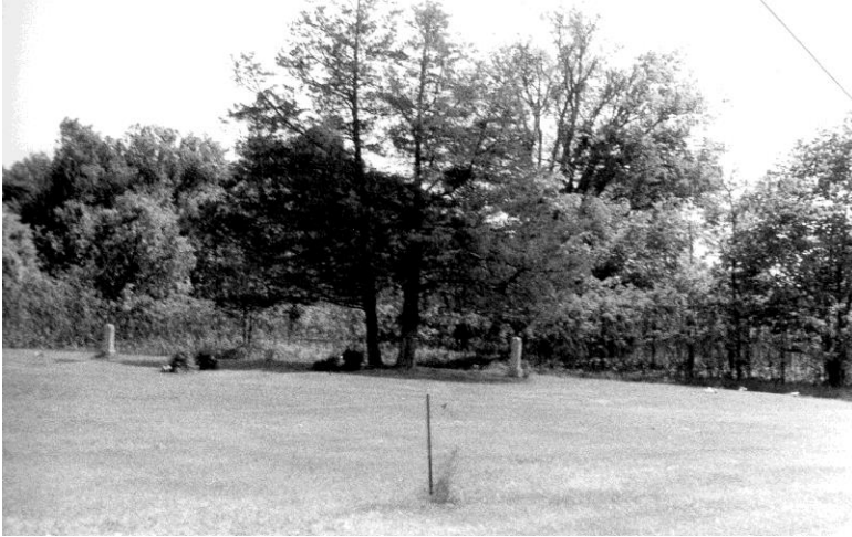
Union Cemetery

An unconfirmed report said that he was buried in an unmarked grave in Union Cemetery east of South Haven. That is the little cemetery at the intersection of County Road 3 and Highway 55 on the northeast corner across from Malco Tool.