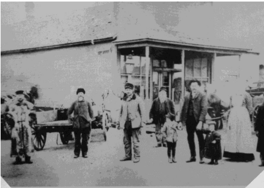
A street scene for turn of the century South Haven. This shot may even include a member or two of the posse.